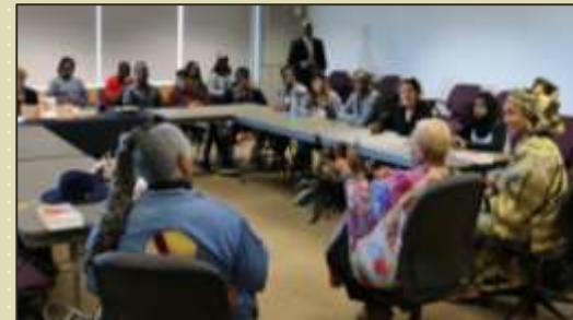
LOFT Healing Event Event, Nov. 2018