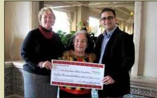
Gracia Molina de Pick Foundation Donation