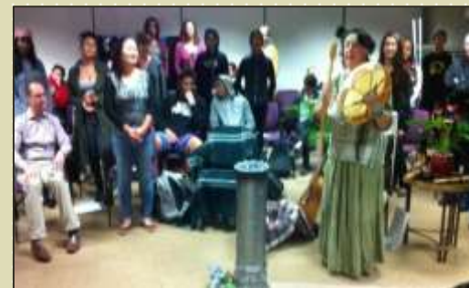
Native American Heritage Event, Nov. 2016