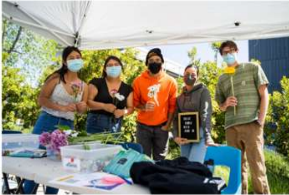
Random Acts of Kindness